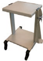
CRYOSTAR TROLLEY, WITH 1 CYLINDER HOLDER

1500.B2 CRYOSTAR TROLLEY, WITH 2 CYLINDER HOLDERS